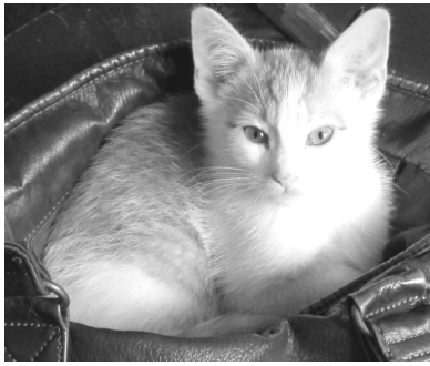
RUSTY is a frisky orange and white male kitten who loves to play with kids and other cats.