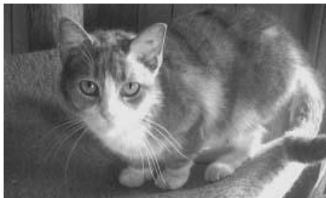
LEA is a 4 yr. old, very petite, gray and white tabby female who adores being petted.

See other wonderful cats and kittens at www.hilltophumane.org or www.petfinder.com or call 781-961-3638. SO FAR IN 2010—79 PUURFECT MATCHES HAVE BEEN MADE!