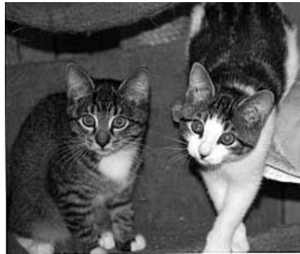
EMMA ROSE is a sweet, friendly 4 mo. old gray and white tiger with white paws.