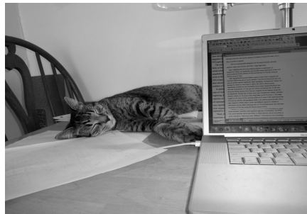
Luigi after a long day on the computer!