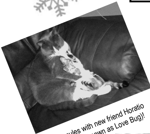
Hercules with new friend Horatio (formerly known as Love Bug)!